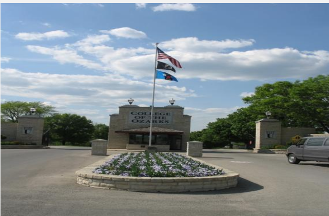
College of the Ozarks – Point Lookout, MO