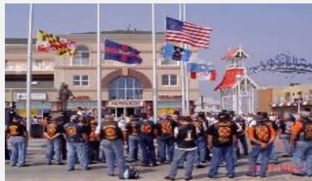
Ocean City, MD