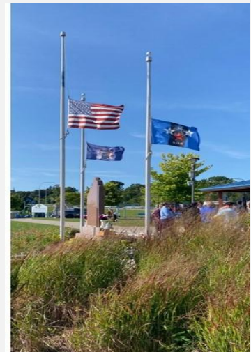
9/11 Memorial – Long Pier – Geneva, NY