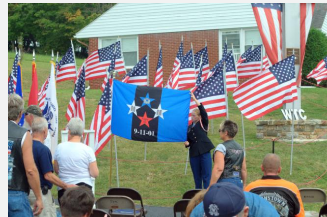
Shanksville Fire Dept. – Shanksville, PA