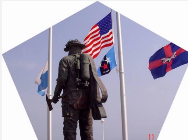
Ocean City, MD