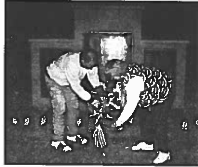
A wreath is placed in front of the monument at the triangle in Red Creek.