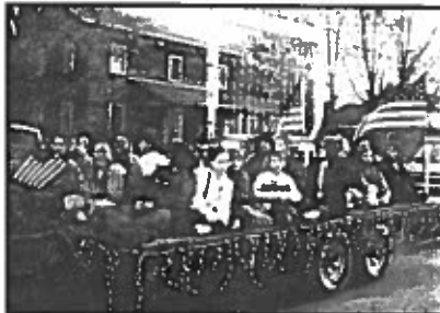
Children in the parade rode school buses to each community where they disembarked and rode decorated wagons. The weather was very cold, but the children were very proud to participate.