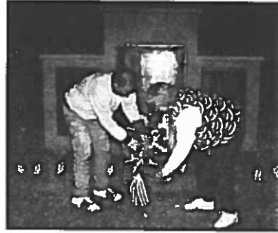
A wreath is placed in front of the monument at the triangle in Red Creek.