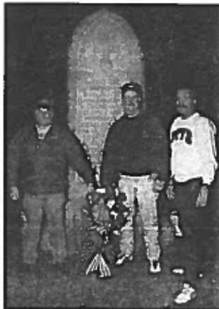
Rose firefighters place the memorial wreath in front of the patriotic monument in Rose.