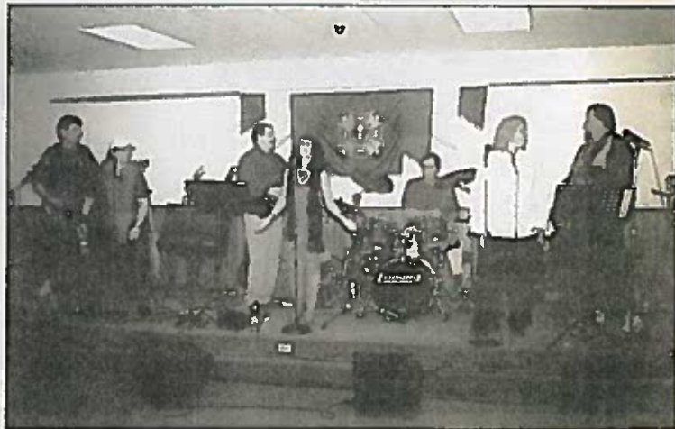
(L to R) Two separate bands joined together for the benefit fundraiser held at the Lyons V.F.W. Post 5092. The band "Reflection" and "For Godness Sake" joined together for one night to perform.